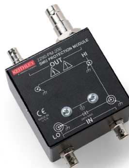
The 2290-PM-200 Protection Module protects low voltage measurement equipment from voltages greater than 200V.

Series 2290 Power Supplies and a 2290-PM-200 SMU Protection Module protect both user and instrumentation from hazardous voltages. An interlock circuit built into the power supplies can be used to ensure that the output voltage is disabled if a high voltage test fixture access door is open. In addition, all Series 2290 power supplies have low voltage analog outputs to permit safe monitoring of the high voltage and the output current.