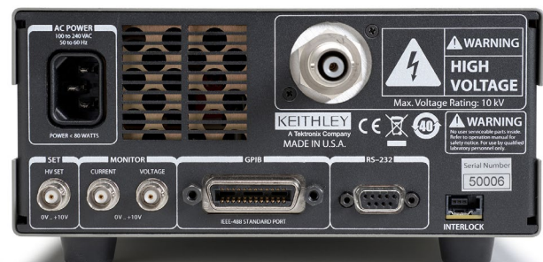
2290-10 rear panel showing the IEEE-488 interface connector, RS-232 interface connector, high voltage output connector, analog control/output connectors, and interlock connector.